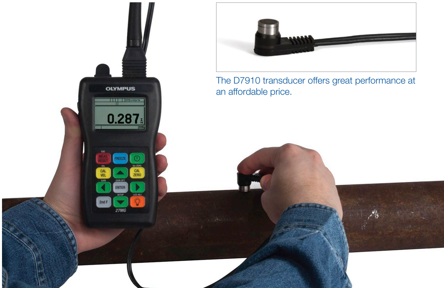
The D7910 transducer offers great performance at an affordable price.

The 27MG thickness gages comes standard with the low-cost D7910 dual element transducer that enables you to make thickness measurements for many basic corrosion applications. For measurements on very thin or thick materials, or small diameter pipes, Olympus has a full line of dual element transducers. Olympus transducers compatible with the 27MG gage feature Automatic Probe Recognition that optimizes transducer performance by automatically recalling the default V-path correction.